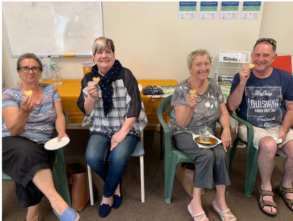
Mowbray Learning Site Builder Time at the Northern Suburbs Community Centre in Mowbray

16 September 2020 18 November 2020 16 December 2020 (end of year celebration) 17 February 2021 14 April 2021 16 June 2021