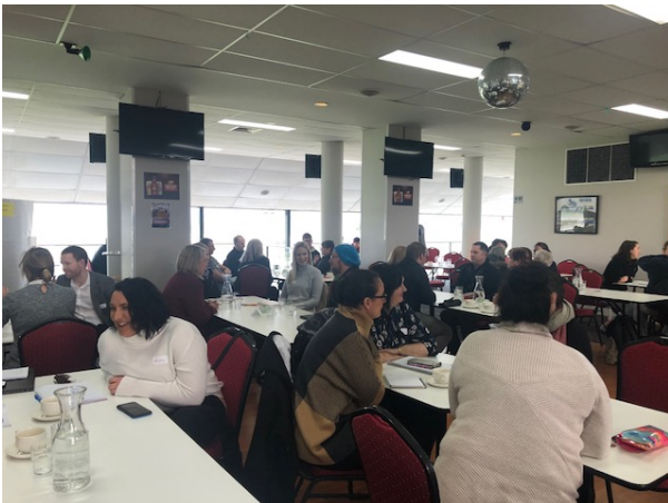
Mowbray Learning Site Community Workshop