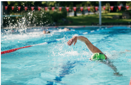
Get AquaFit at Launceston Aquatic Centre

Enquiries | 6323 3636 | www.launceston.tas.gov.au/lac