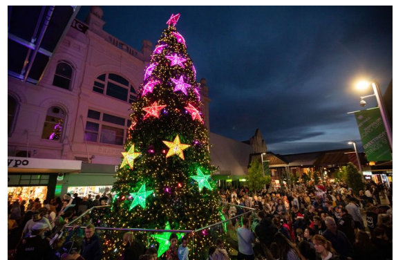
Christmas 2022 Lighting of the Tree