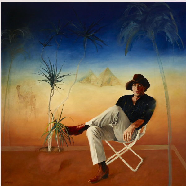
Artwork: Wes Walters Molly 1983, collection of Ian 'Molly' Meldrum, Melbourne © Estate of Wes Walters