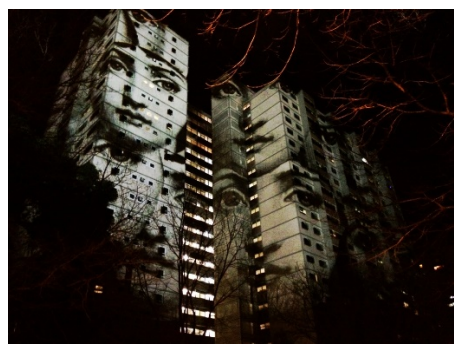
Nick Azidis, Untitled , 2017. Commissioned by the Gertrude Street Projection Festival, courtesy the artist.