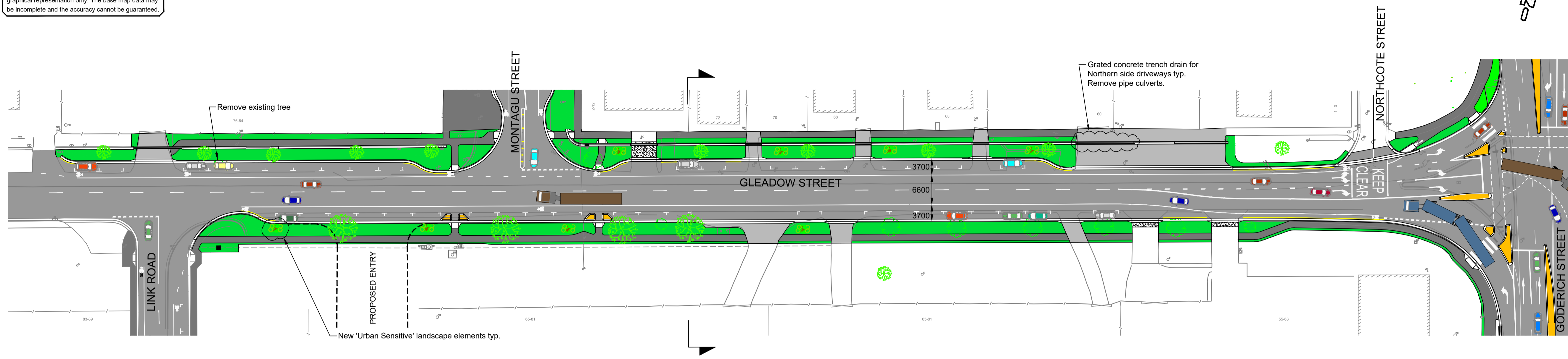
CONCEPT PLAN 1:500

IMPORTANT NOTE The base map information shown with this design, has been drawn from the City of Launceston 1:500 Detail Survey mapping records and should be treated as a graphical representation only. The base map data may be incomplete and the accuracy cannot be guaranteed.