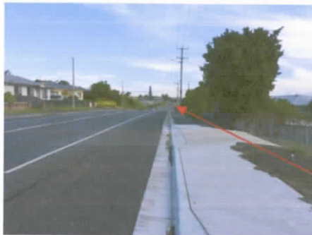
bottom of the hill