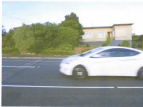
A car at 105m