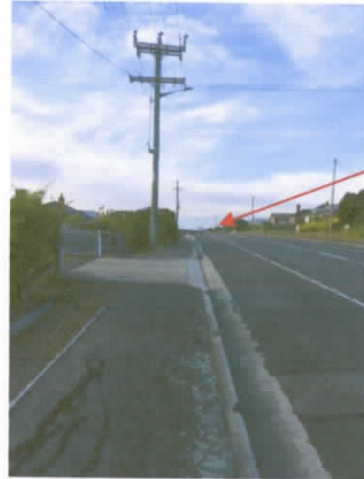
Same car at driveway

The visibility of cars coming out will be hard.