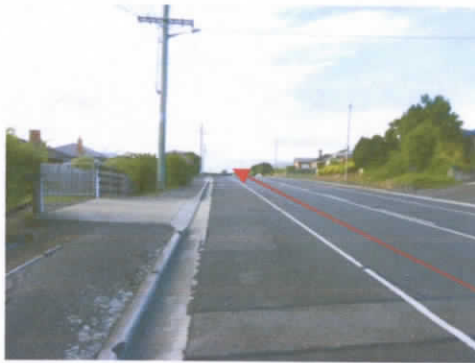
Again location of driveway and you in a car are doing 60km

The visibility of cars coming out will be hard.