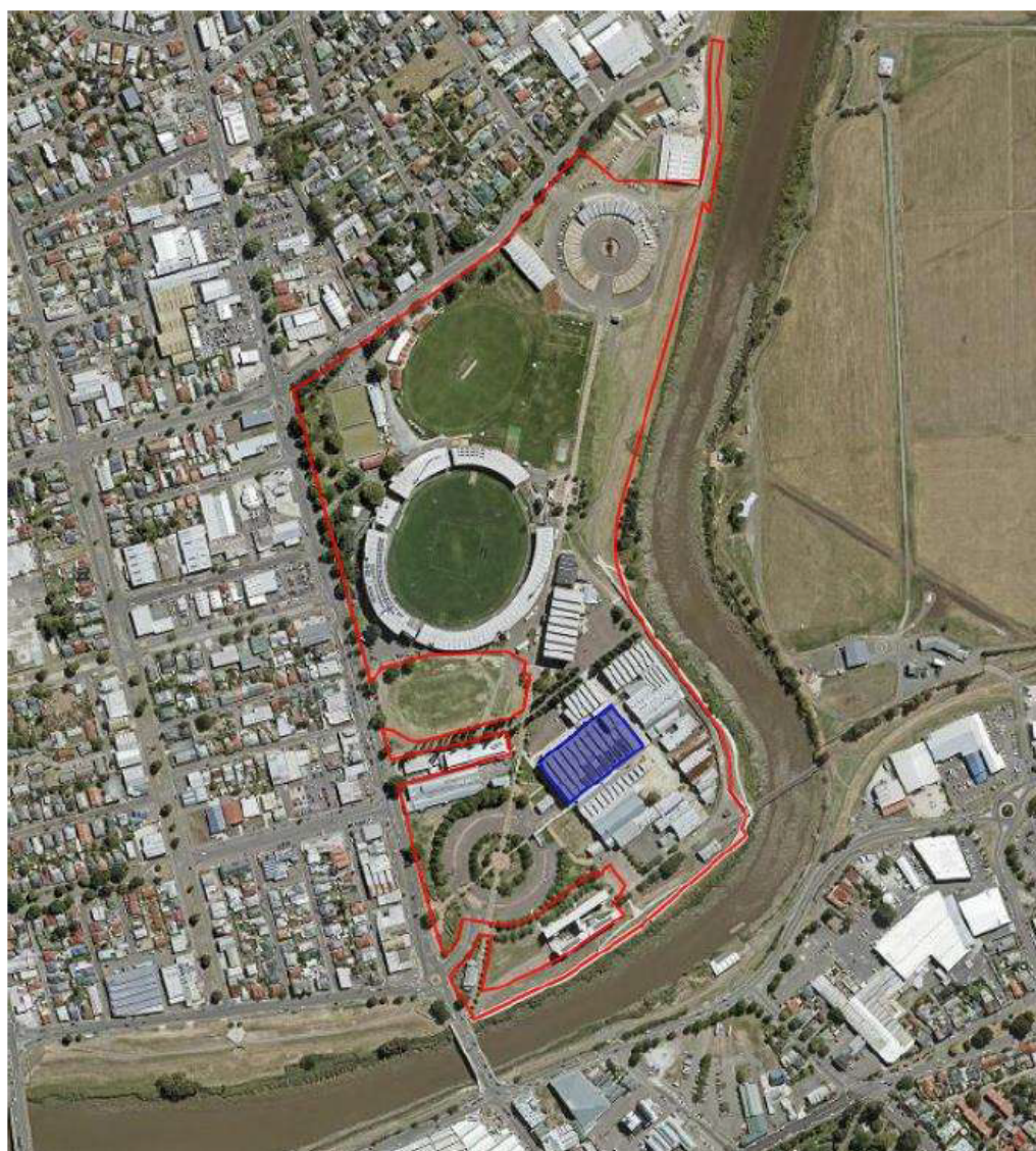
Figure 2: Stone building location (blue) and cadastre in red (The List 2020)

The site fronts Invermay Road and has primary access from Invermay Road, with additional access via Forster Street and Barnards' Way.