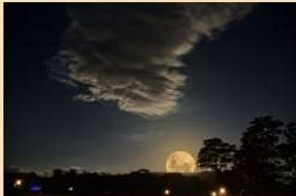
Grey nomad stargazers and photographers were out in force recently as the super 'pink' Moon lit up the skies across Australia. Ian and Di Jenson were in pole position to capture the phenomenon as the Moon rose over the Glenleigh Camping Grounds in New South Wales. Stunning!

Only self-contained campers should be allowed to camp in places where there are no facilities. Some of us spend a lot of money on our self-contained rigs so we can wild camp. Don't take that away from us ... but do take it away from those who want their cake and eat it, too. If you're not self-contained, then you need to stay in paid camping facilities ... simple as that.