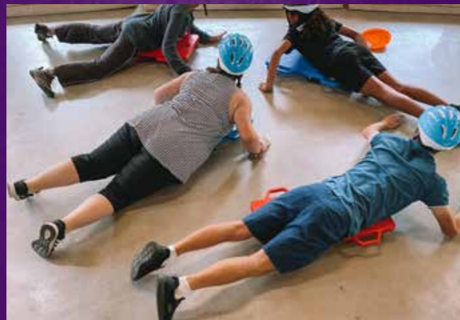
Camping at Camp Carnaco, Swan Point (2021)