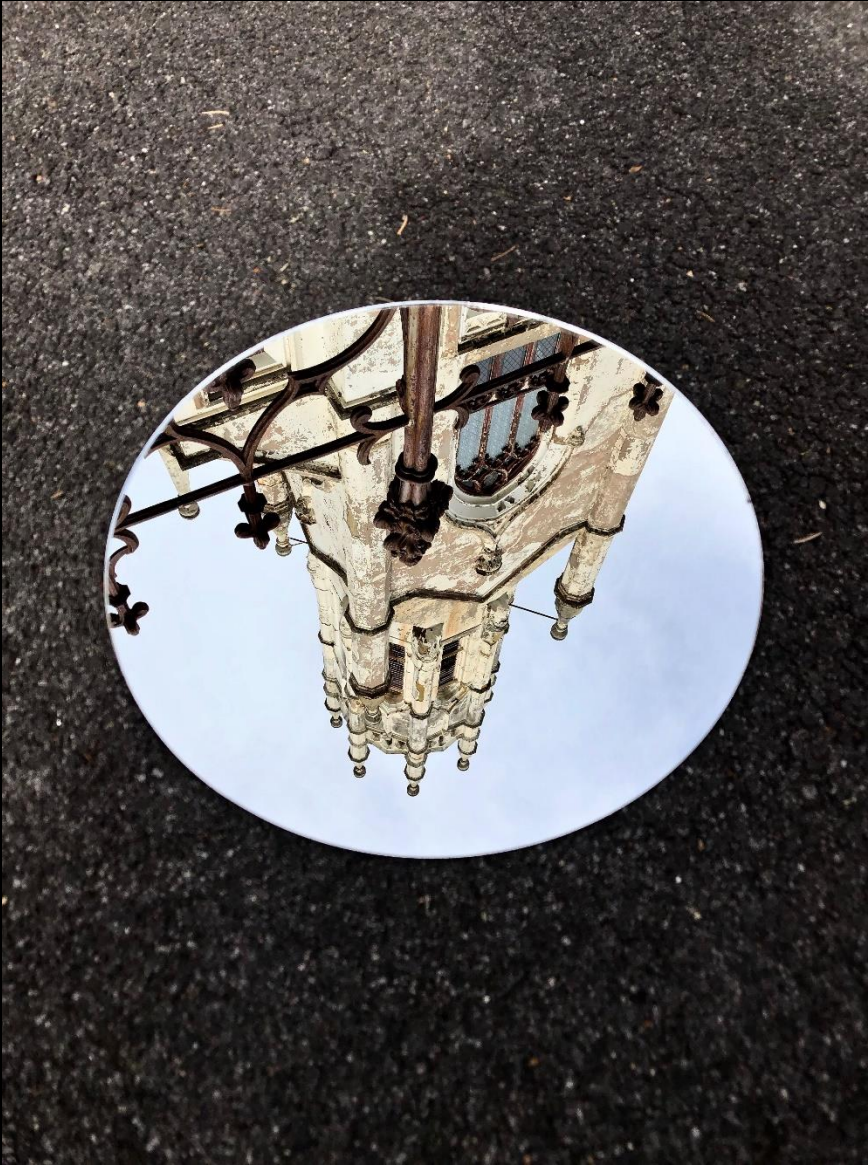
Chalmer's Church Launceston

'The mirrored reflection of Chalmer's Church on St John Street, Launceston.'