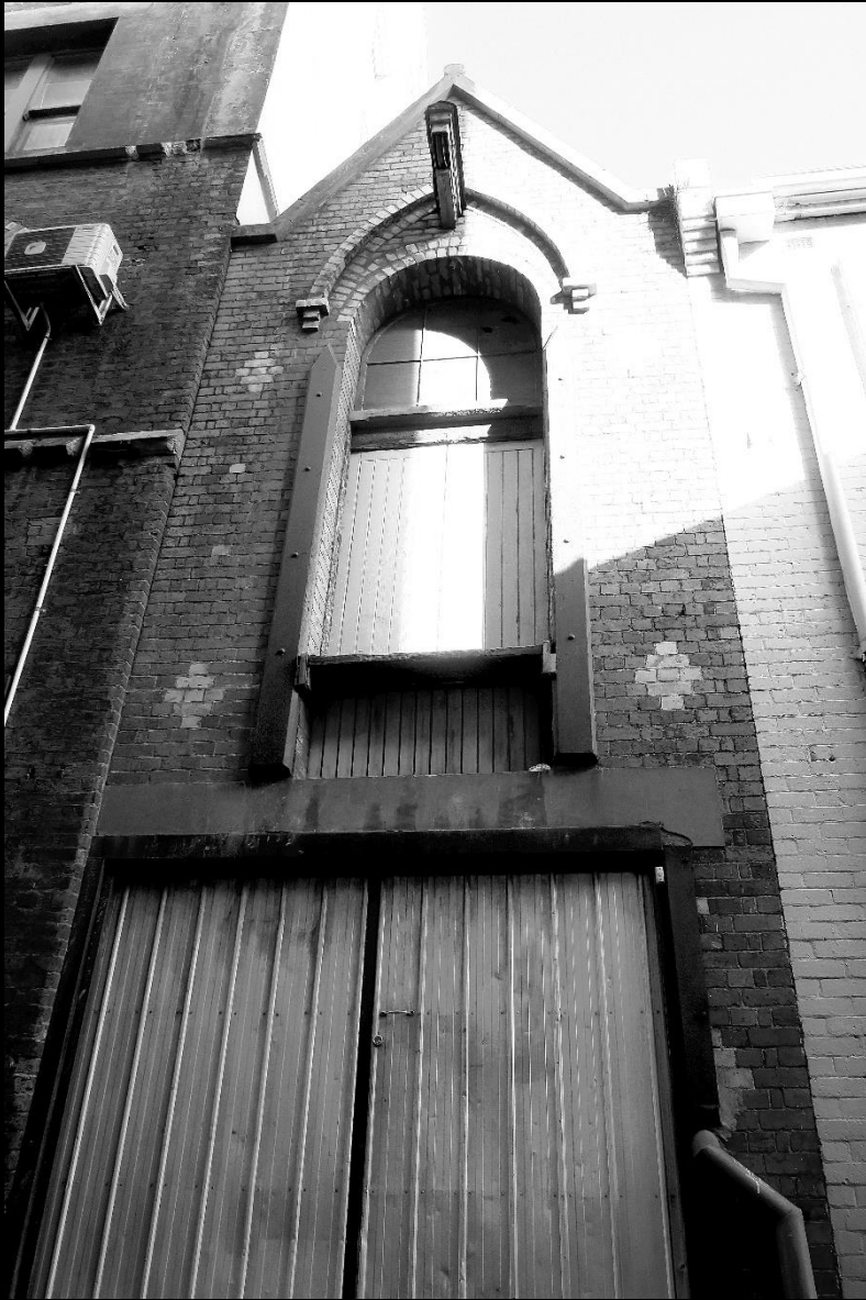
Genders Lane Launceston

'This hidden piece of history in Genders lane is full of detail with diamond pattern brickwork, pointed wall bracing posts and a Victorian hoist.'