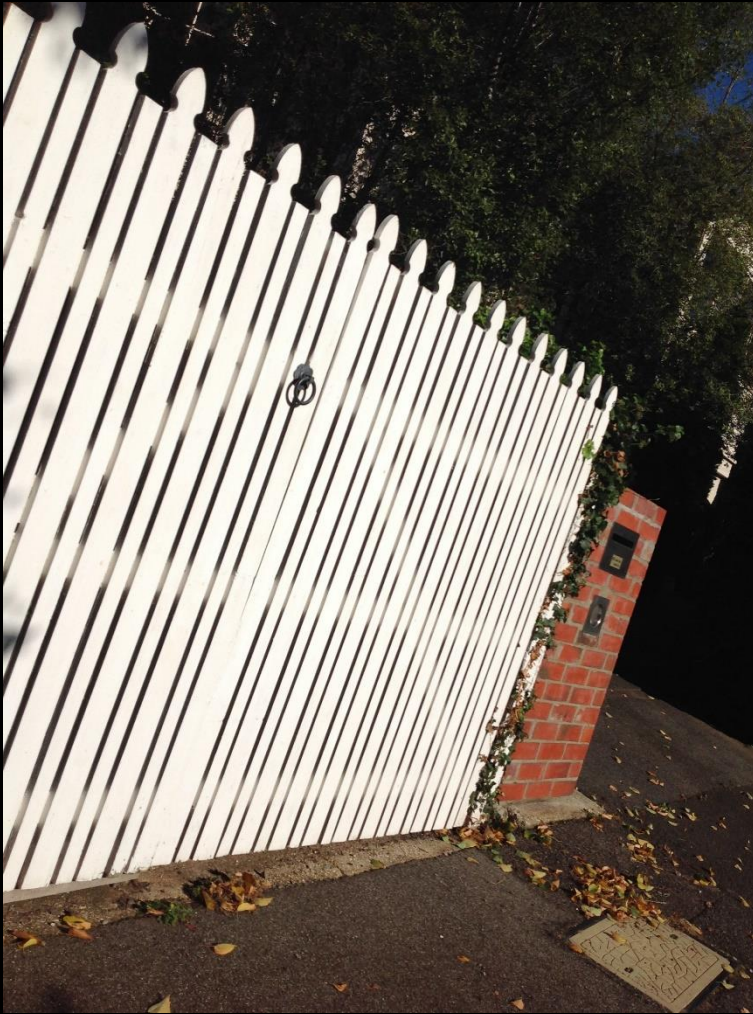
Old style fence - timber Launceston

'It has an olden day handle and a calm look.'