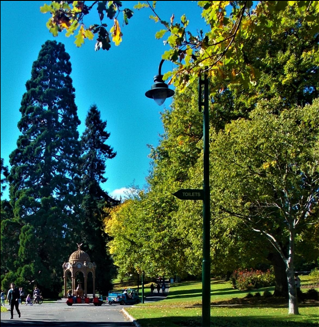
Park Life City Park, Launceston

'City Park is a special place to escape to in the heart of the city.'