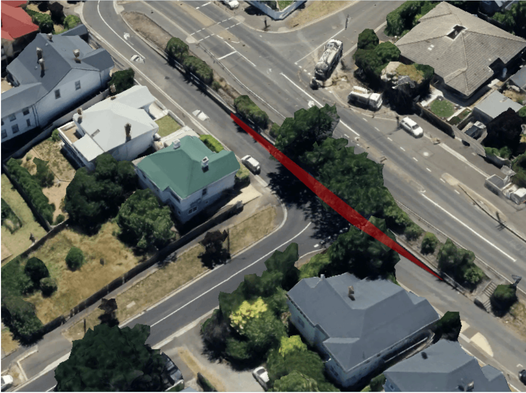
Figure 3 - Howick Street and High Street