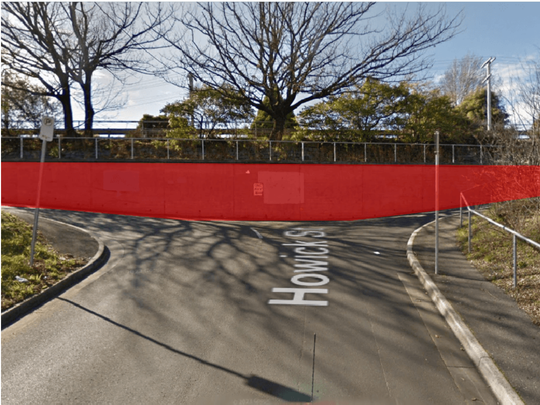
Figure 4 - Howick Street (as seen on ascent)