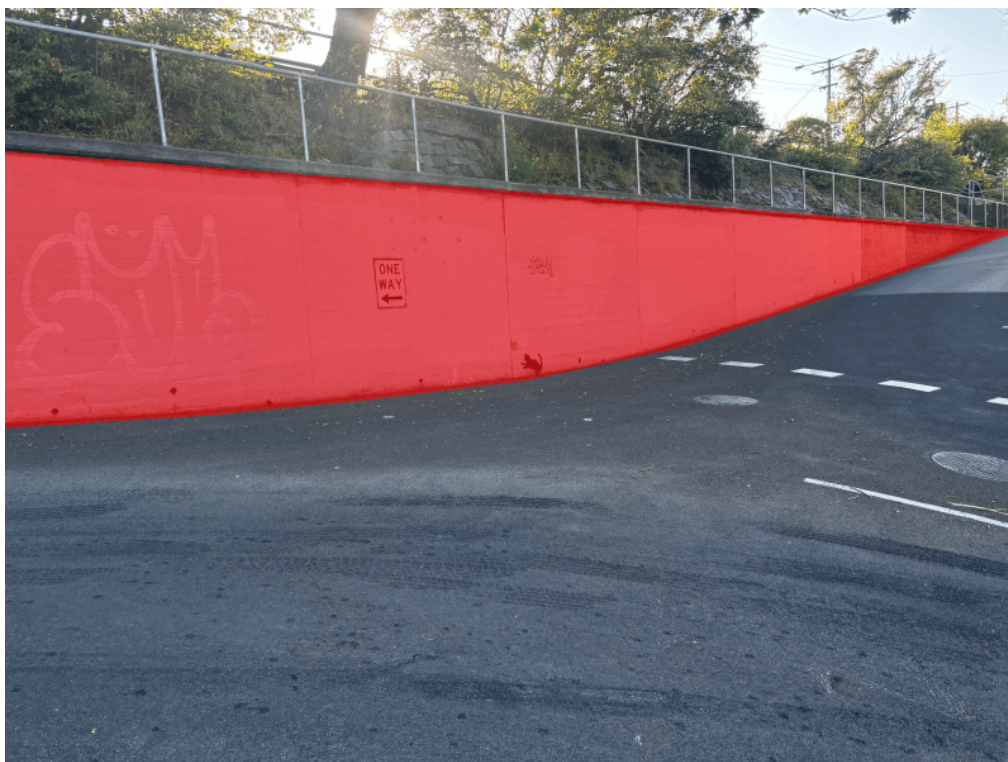
Figure 1 - Howick Street (as seen from the road)