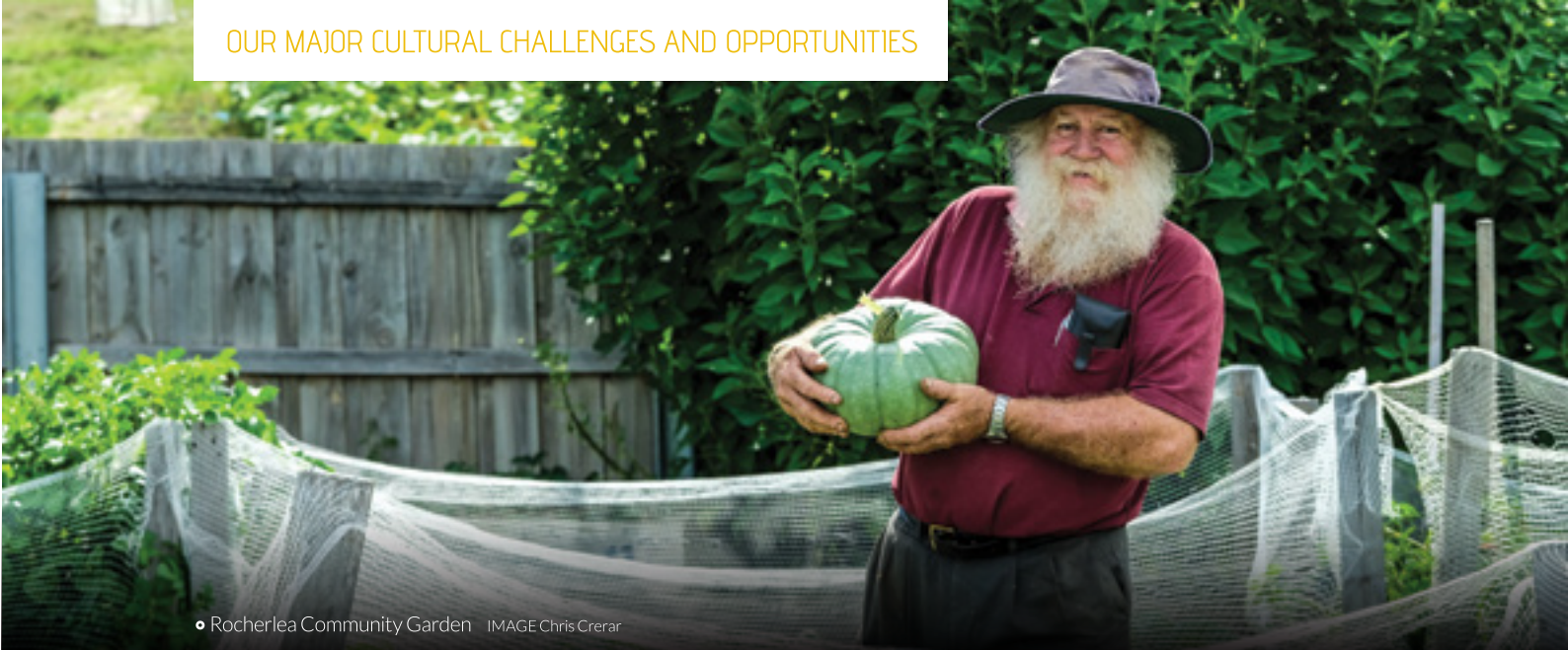
◦ Rocherlea Community Garden