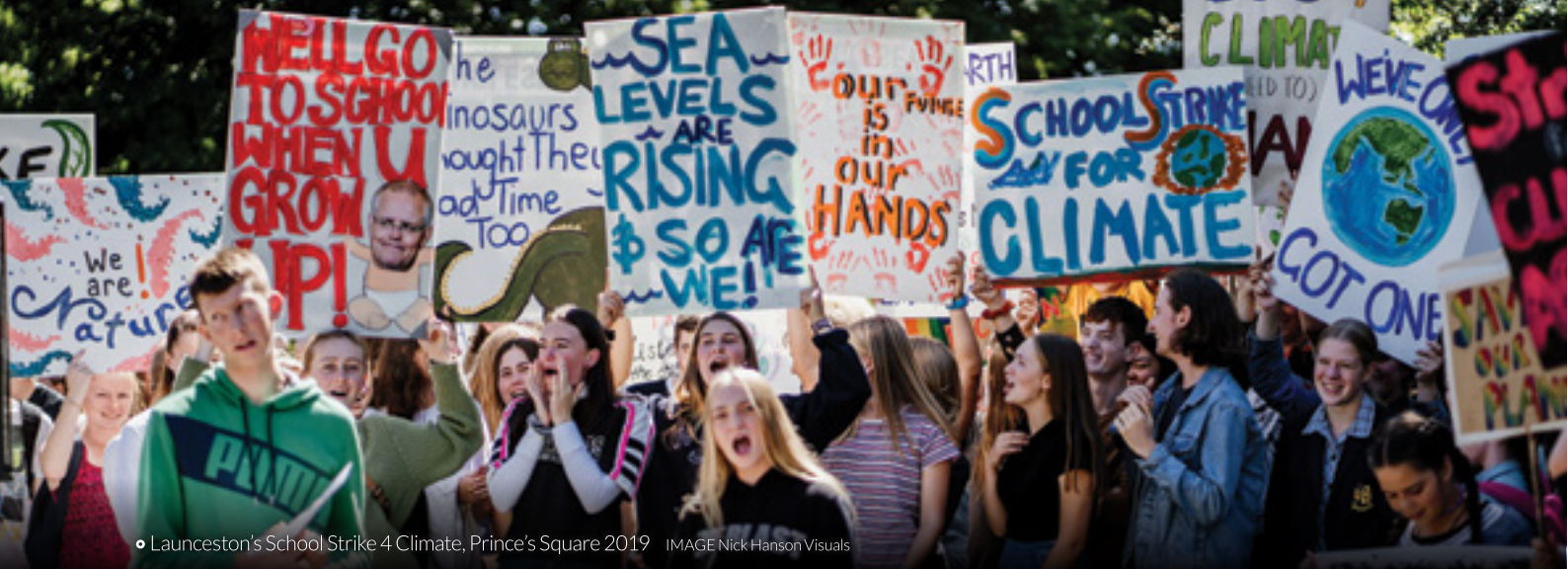
• Launceston's School Strike 4 Climate, Prince's Square 2019