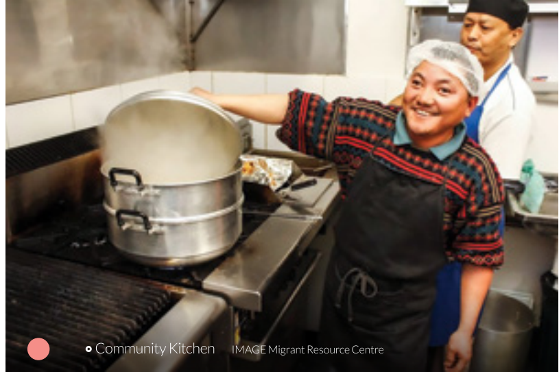
• Community Kitchen IMAGE Migrant Resource Centre