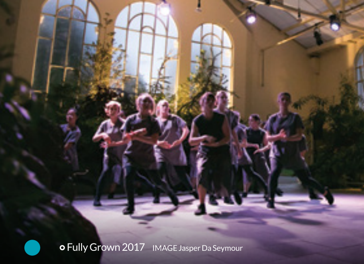
• Fully Grown 2017 IMAGE Jasper Da Seymour