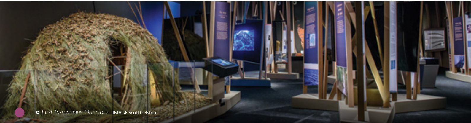
• First Tasmanians, Our Story