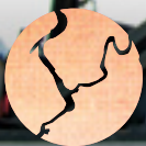
• Courtney Barnett, Mona Foma 2019