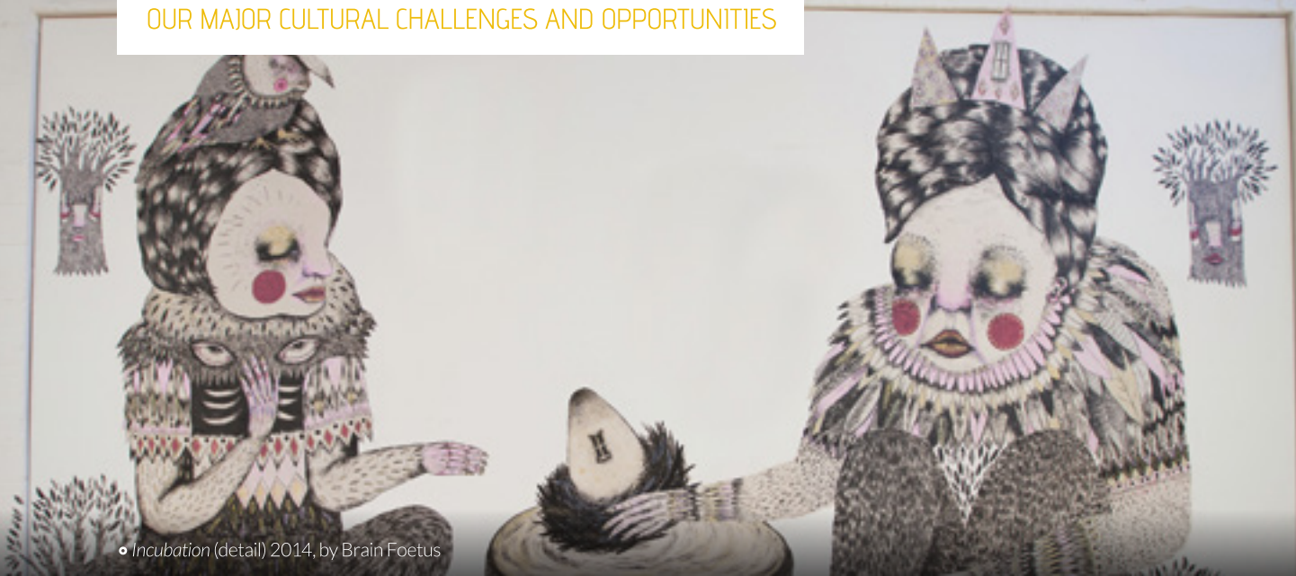
• Incubation (detail) 2014, by Brain Foetus