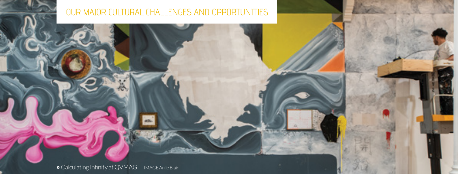
◦ Calculating Infinity at QVMAG