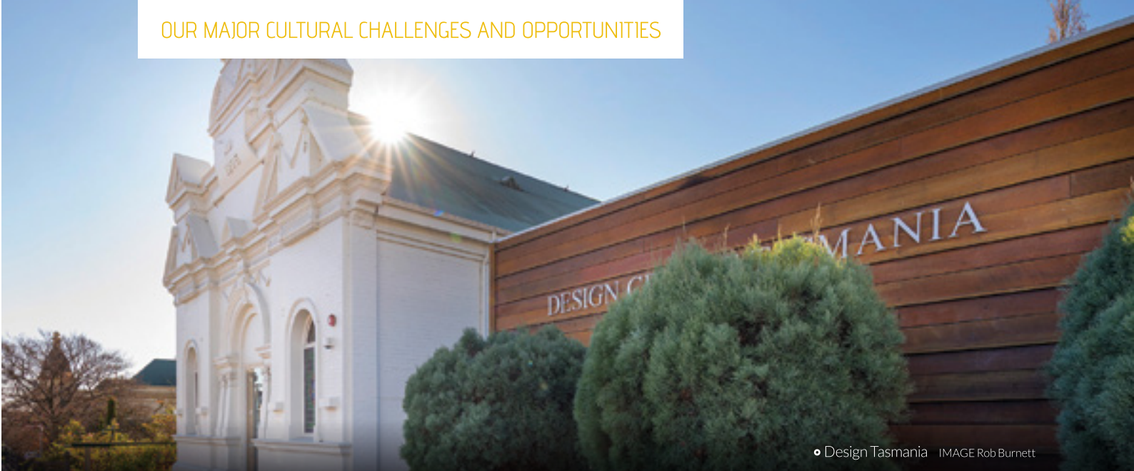
• Design Tasmania