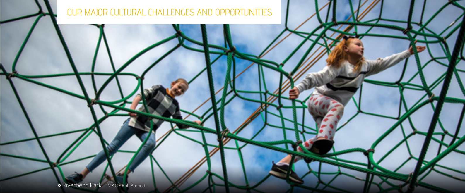
• Riverbend Park